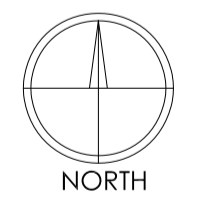
Key Plan 1:1250